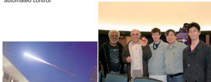
CSM staff and GOTO installers celebrate the replacement of flood-damaged equipment.