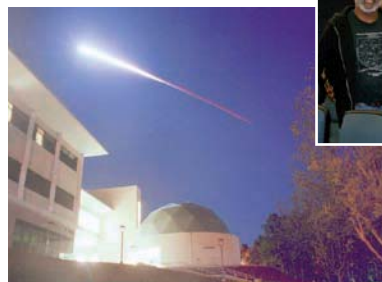
Eclipsed last year by a runaway sprinkler system, the CHRONOS HYBRID is again shining brightly!