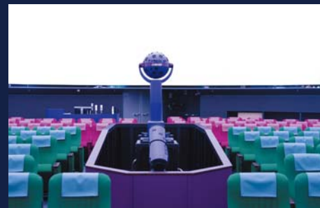
New : Model CHIRON III