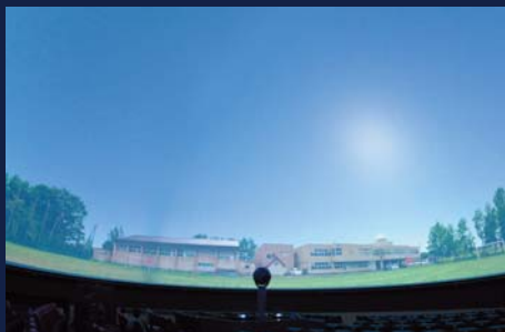
Panoramic image of local school

VIRTUARIUM X is currently a product for domestic sales only, but GOTO INC works with other select fulldome providers to create HYBRID planetariums around the world. Ask GOTO about a HYBRID upgrade for your planetarium!